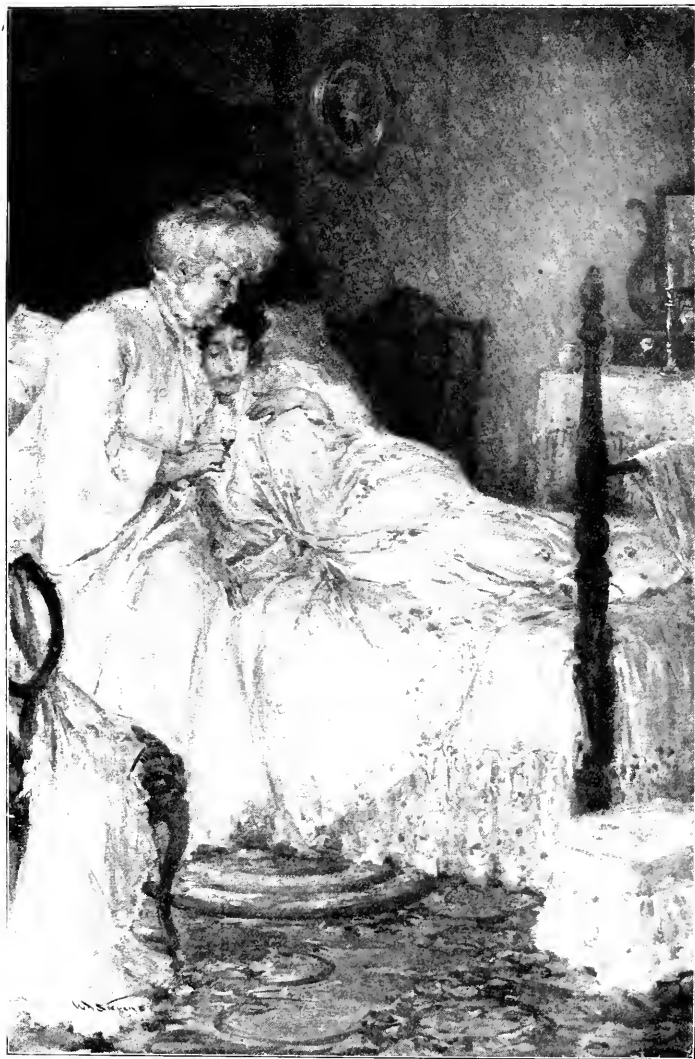
" SHE WAS SIPPING A GLASS OF PORT-WINE, WITH MRS. ANDERSON SUPPORTING HER HEAD."